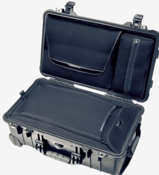
Pelican Carry Case

Pelican Carry Case to carry the portable devices and accessories.