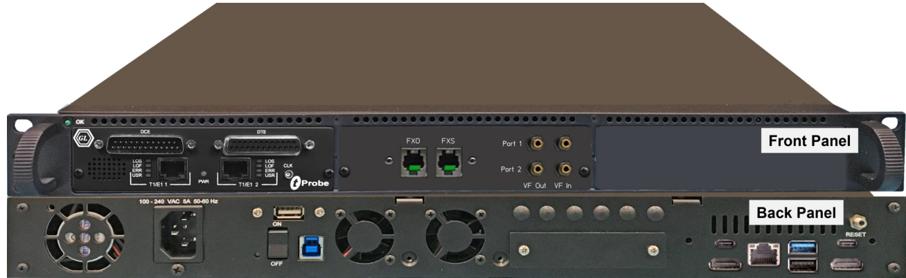
Figure: mTOP™ T1 E1 tProbe™ 1U Rack Unit